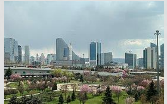
Söğütözü central business district