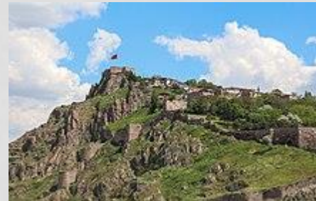
Ankara castle and citadel